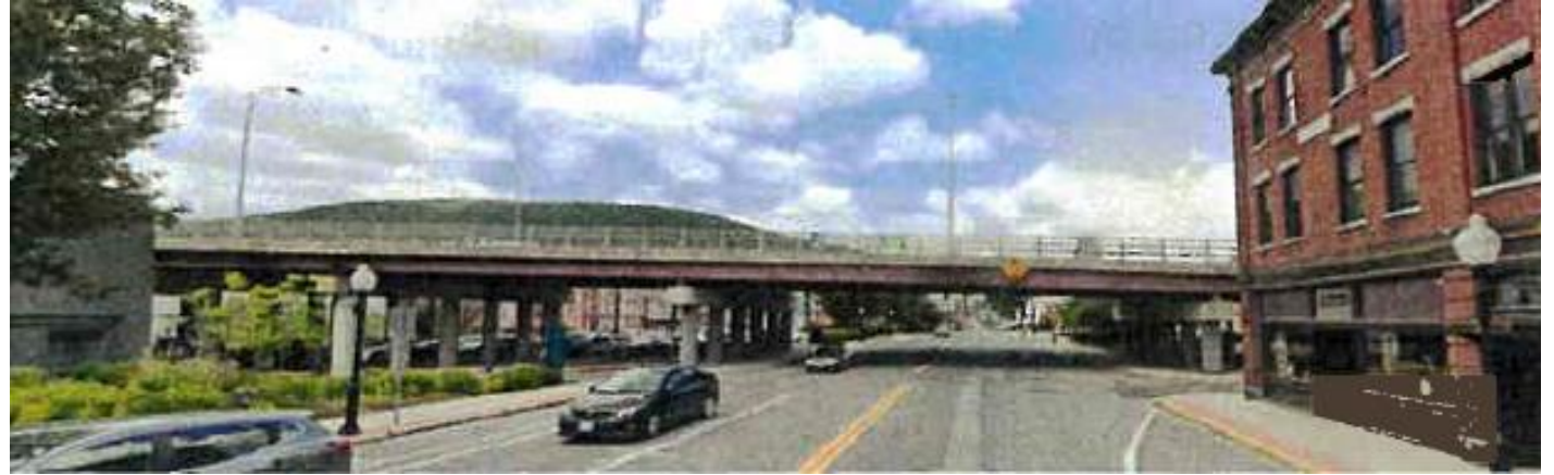
Source: City of North Adams, Route 2 Overpass RCP Application