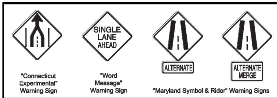
Figure 0.1 - Example of alternative merge signs (8)

The final two questions pertained to the participant's opinion of the joint-merge or central-merge concept. This concept is an alternative design to the downstream merge of the ATL into the single CTL. Each participant was asked to give his or her opinion of the central merge idea as an alternative to the existing conditions. Many participants were hesitant to give the new concept credit, as they believed it to be a confusing design. Clearly, this alternative design would necessitate training at the young driver level. Many participants believed it to create a greater concern for safety in terms of vehicle merging collisions. The questionnaire also presented the picture shown in Figure 0.1, and participants were asked to select the sign that they believed to be the most impactful. The two left-most sign displays were chosen as the favorites in this case. Specifically, a greater number of participants seemed to be attracted to the idea of a text-based sign display, as opposed to one with only an image of the standard merge design. This conclusion confirms that this group of participants, though a small sample size, would find a central merging sign with text more appealing than a simple image. These results should inform the future research of central merge design.