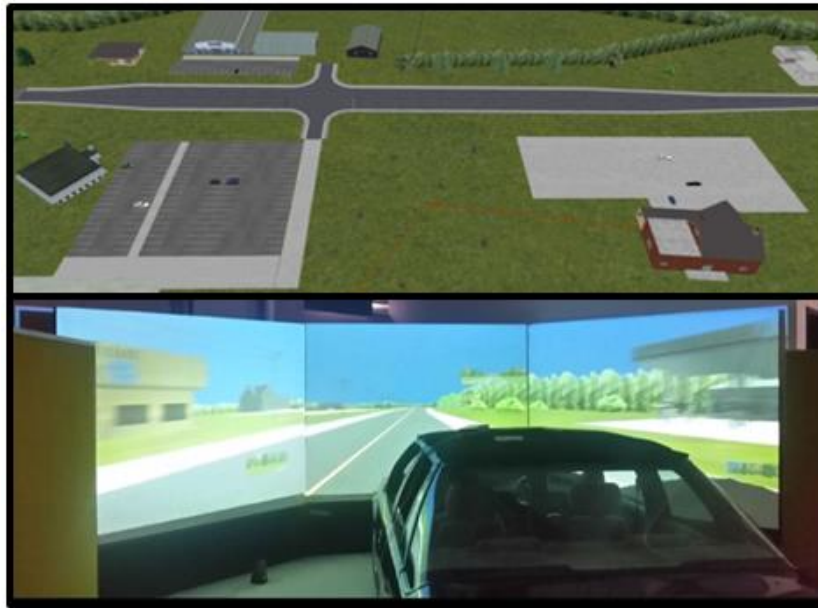
Figure 0.2 - RTI driving simulator and ISA model at the University of Massachusetts Amherst