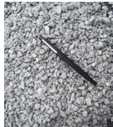
Figure 4. No. 8 bedding material and joint material. Finer gradations may be used such as No. 89, 9 or 10. Sand is never used.