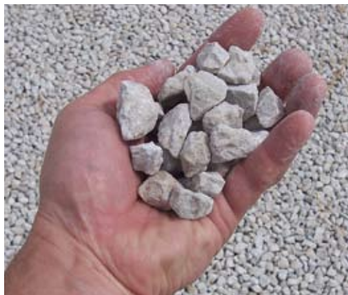
Figure 3. Smaller than No. 2 stone, No. 57 aggregate provides a base to receive the bedding material and pavers.