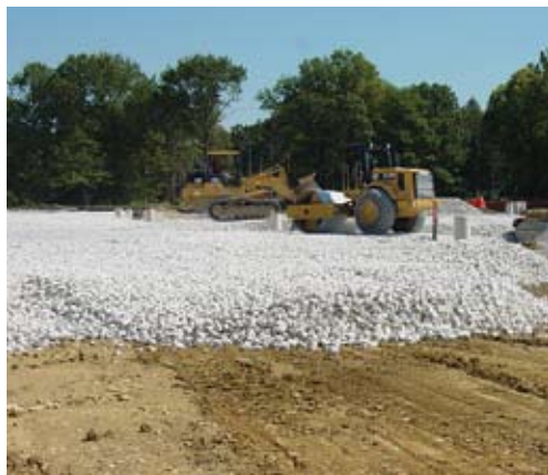
Figure 2. No. 2 subbase stone is spread and eventually compacted over a non-compacted soil subgrade for this large PICP parking lot in Illinois.

Moreover, the pavement should not receive runoff until the entire contributing drainage area is stabilized with vegetation. Obviously, vegetation doesn't grow overnight and rain will likely fall right after the pavement is installed. Therefore, erosion control matting can stabilize soil while grass or other vegetation starts to grow. This should be included in the con-