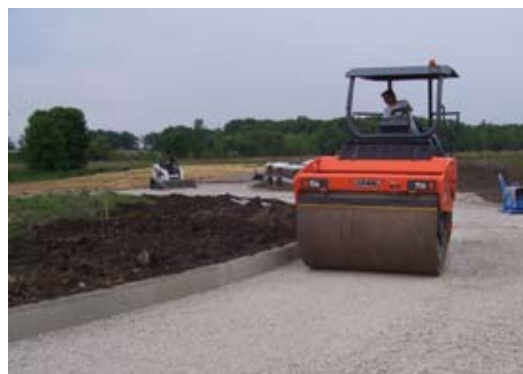
Figure 5. A dual drum roller compacts the open-graded base first in vibratory then in static mode. This particular machine is a 12-ton roller.

Figure 5 shows a dual drum roller compacting the open graded aggregate. The No. 57 base layer can be spread and compacted as one 4 in. (100 mm) lift. Figure 5 shows the No. 57 aggregate spread over the No. 2 stone and being compacted with a heavy plate compactor. This equipment is also effective in compacting No. 57 stone. Compacting will