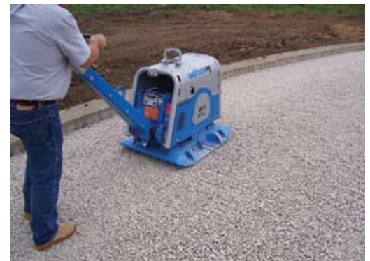
Figure 6. A 13,500 (60 kN) reversible plate compactor is also effective in compacting No. 57 stone.