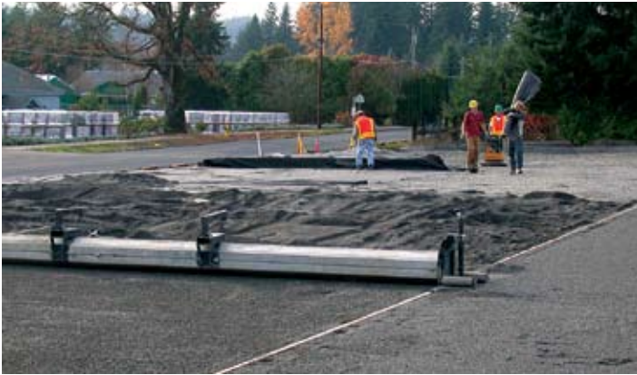
Figure 7. Mechanical screeding of the bedding material speeds construction on larger projects.

be made a bit easier when all stone surfaces are moist. This enables the particles to slide and move into their tightest fitting figuration more easily.