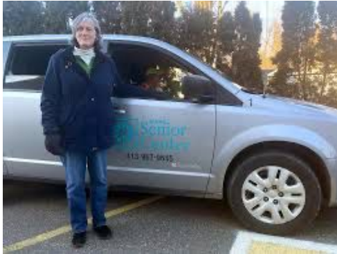
Baystate Community Faculty