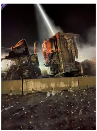
The driver of a semi truck that caught fire after a crash on I-70 near Underwood Street escaped with no injures Monday night. The westbound lanes of the interstate remain closed this morning.

Roach said the plan is to eventually get